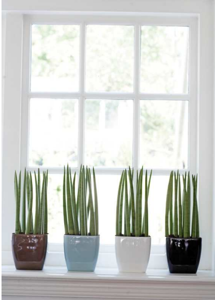
Brussels in diamond

The Diamond finish by Elho is a high gloss covering which is ultra modern and stylish.