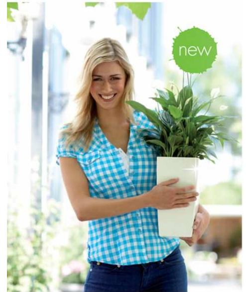
Milano in diamond