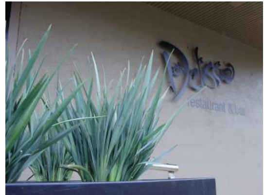
Green Inspiration at Delissio restaurant & bar

We trust you find this issue inspirational and look forward to providing you with more Inspired articles in the future.